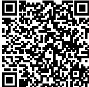
Visit our product page